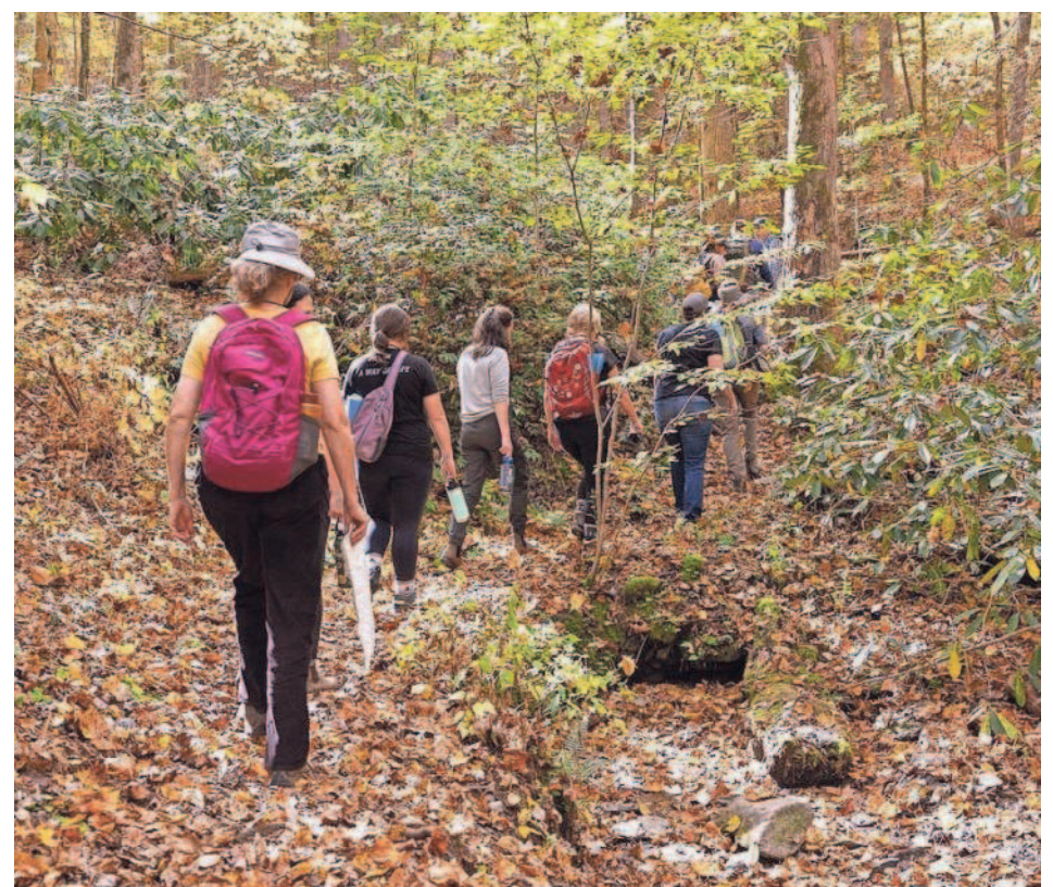
At the Tremont Writers Conference, certified naturalist guides will lead conference participants on afternoon hikes to see the flora and fauna of the Smokies.