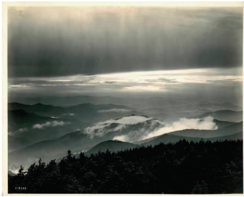
A George Masa photograph of a sunset as viewed from Mount Mitchell northeast of Asheville, NC.

In addition to support from Smokies Life, the co-authors received a Podell Endowment Award for Research and Scholarship that allowed them to hire language experts and researchers in Japan and on the West Coast to help unravel the mysteries. They even engaged facial-recognition software to help confirm Masa's original identity in Japan before he chose to reimagine his life in the states.