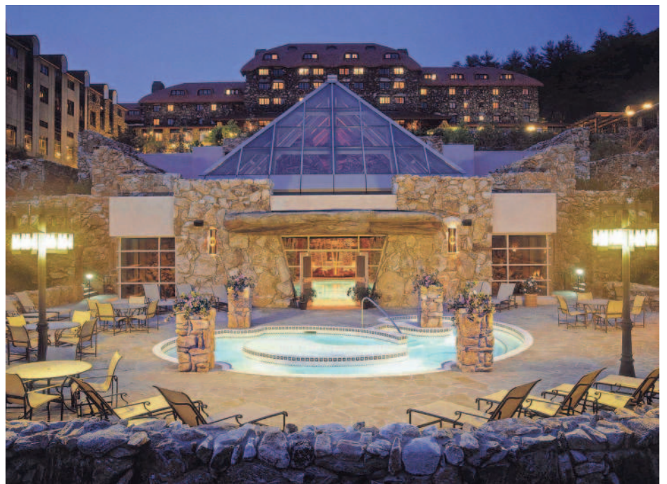
Another pool at the Omni Grove Park Inn. OMNI GROVE PARK INN