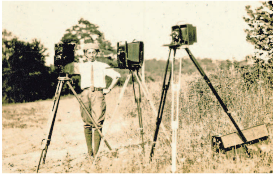
Photographer George Masa stands with two view cameras and a motion-picture camera on the grounds of the Biltmore Estate circa 1920s.